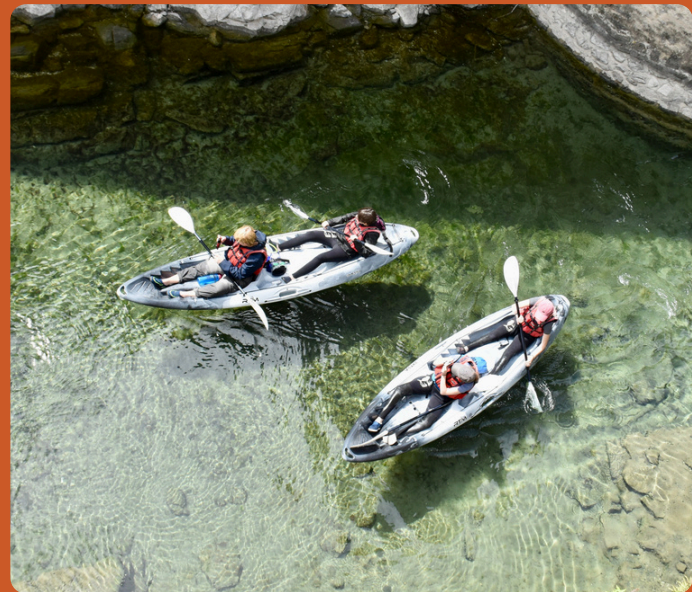
Kayak Sit On Top