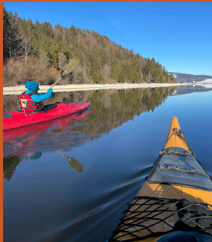
Kayak de mer - sea kayak